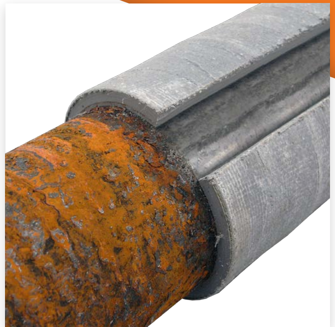
Section removed showing uncorroded pipe