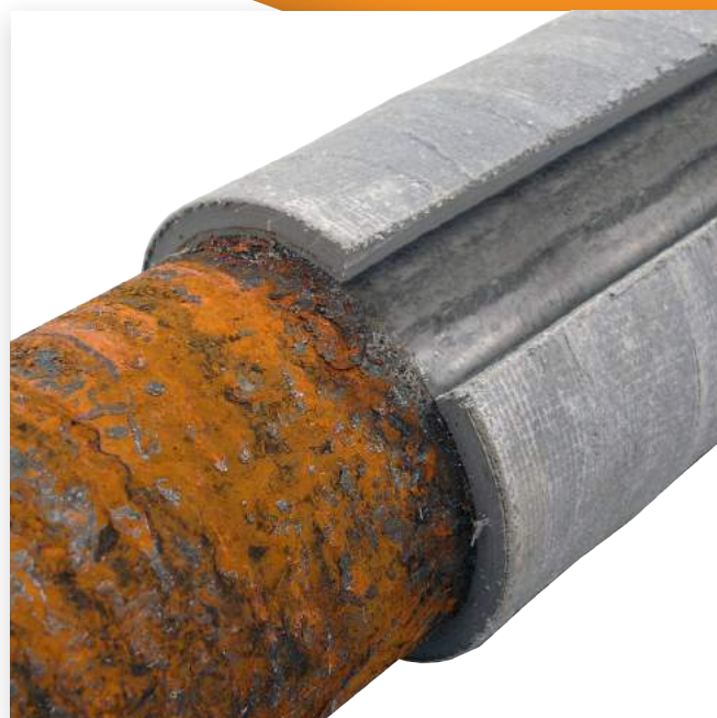
Section removed showing uncorroded pipe