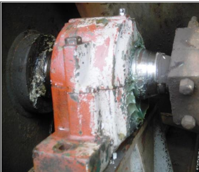
The unit after removing the Oxifree protective coating