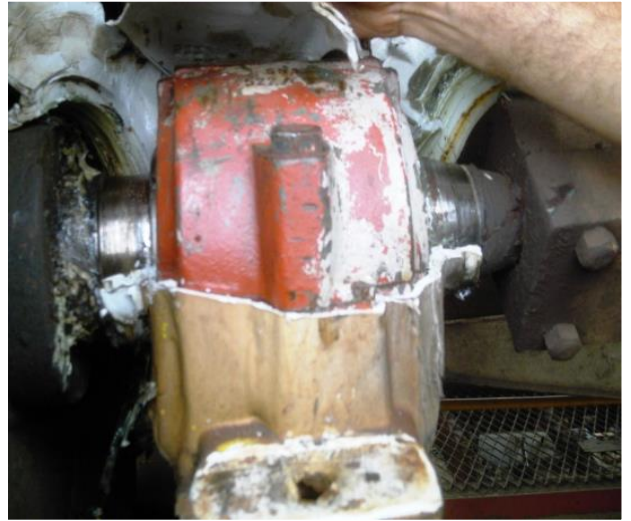
The unit being opened at the end of the season of Oxifree protection